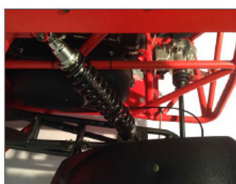
Nitrogen Shock Absorber