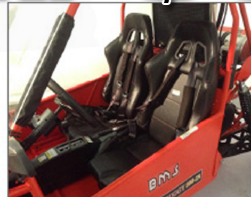
Comfortable Large Seat