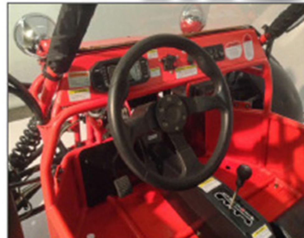
Adjustable Steering Wheel