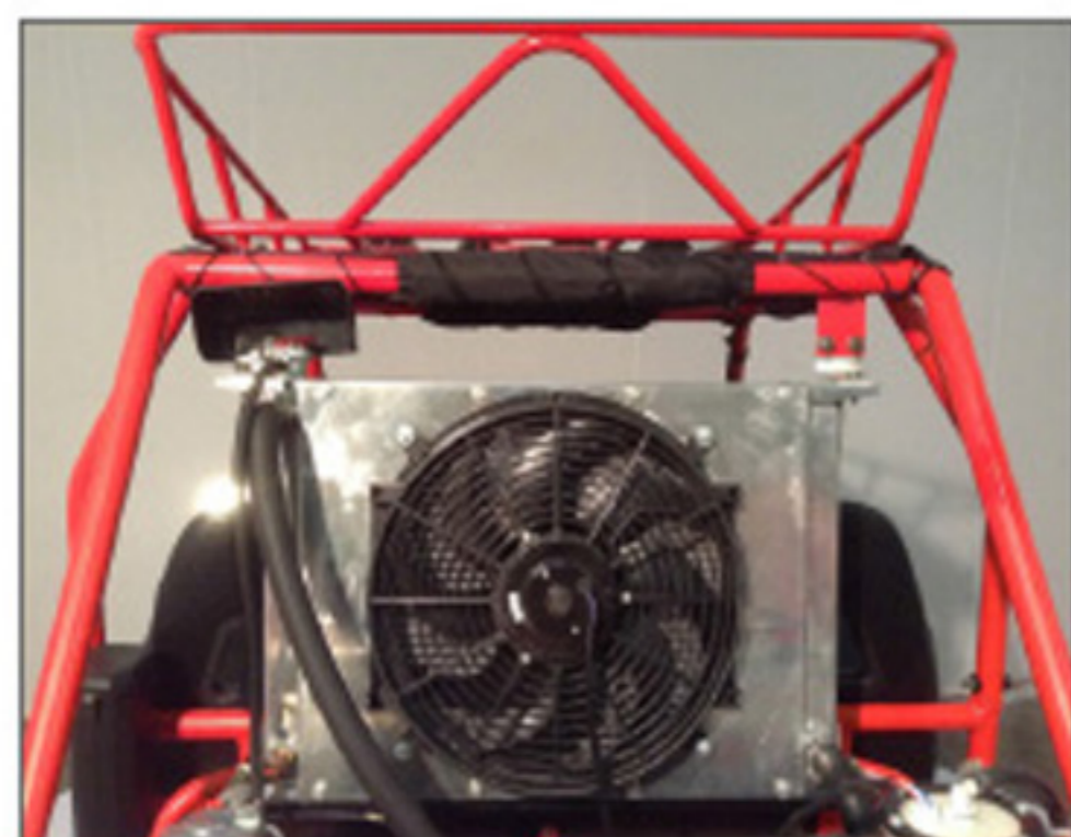
High Power Cooling Fan