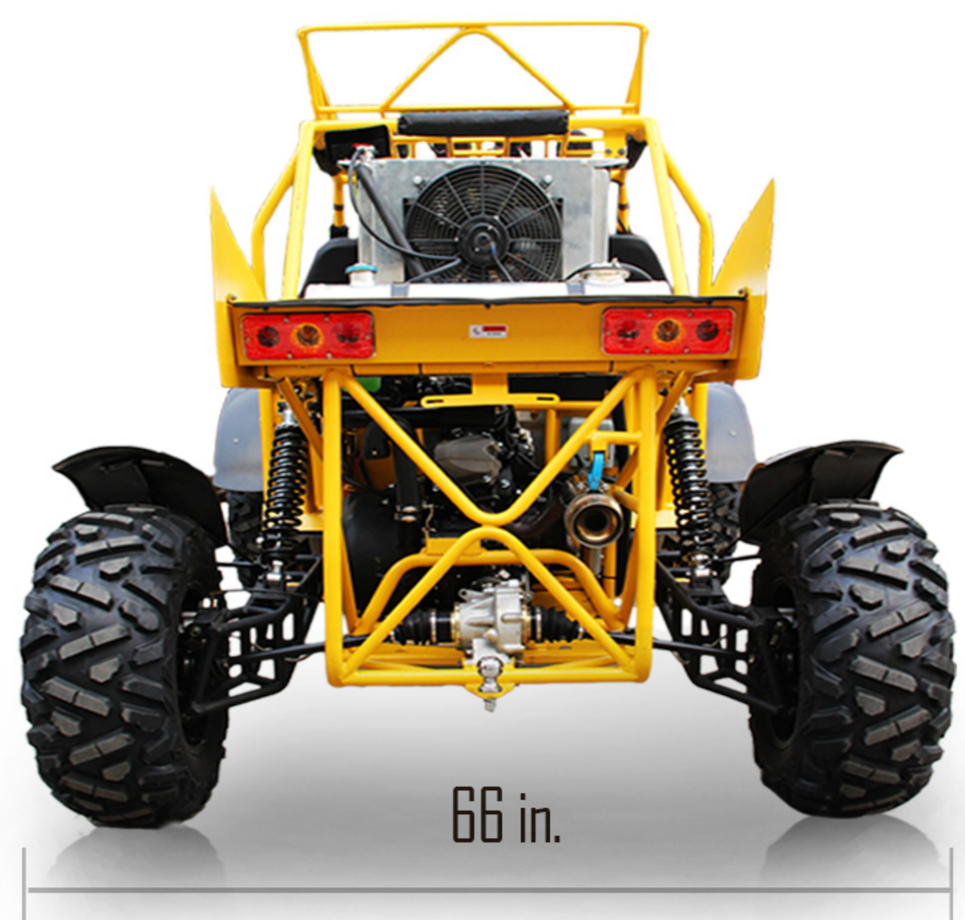
V-TWIN BUGGY 800